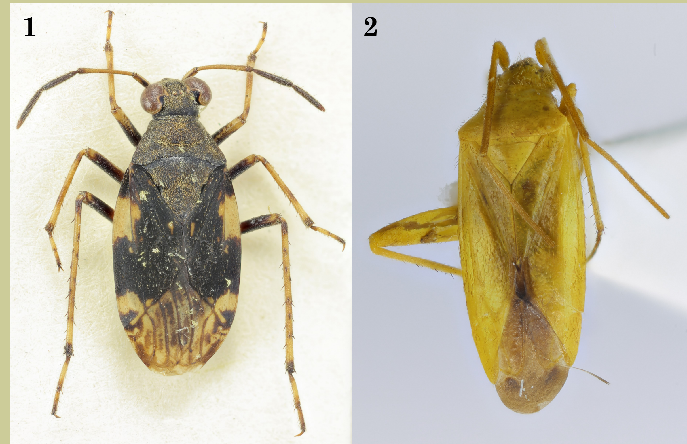
1: Teloleuca branczikii . Zberkový kus zo zbierok Moravského múzea v Brne. Fotil: Luboš Dembický. 2: Eurycolpus flaveolus . ♂, Haligovské skaly, 1.VIII.2017, V. Hemala lgt. Fotil: Luboš Dembický.

SK: Straňany, dolina Kýčerského potoka, 3.VIII.2017 (Hemala in press.)